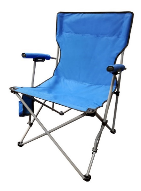
Recalled Caravan Sports Armed Chair/Padded Arm Bagged Chair